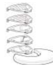
Five snap-in discs