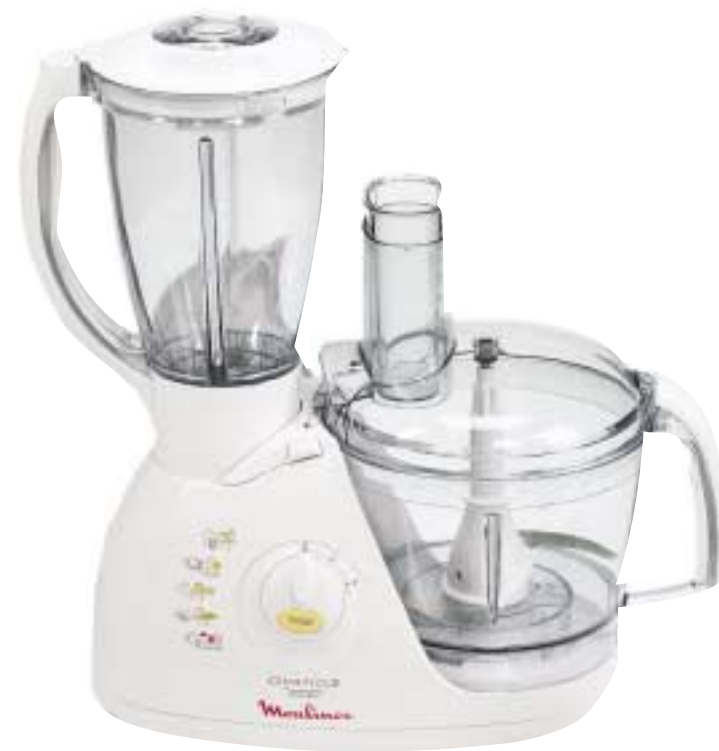
AT7- Ovatio Food Processor

Important safety information for your food processor